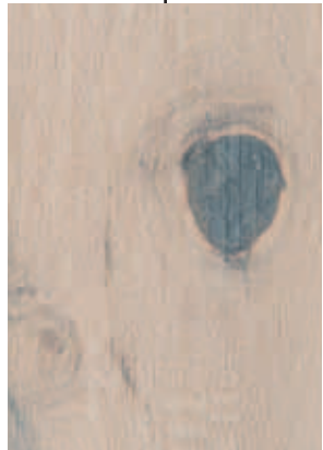
Open and closed knots

These floors have a rustic appeal that highlights the wood's natural character. Some distinctive marks may become prominent over time due to changes in the environment.