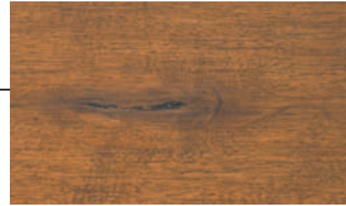
Surface holes and hairline cracks

These floors are renowned for their refined antique styling. To create this look, pronounced color variations and natural character traits are all permitted. The staining process simulates the look of normal wear and tear without altering the quality of the finished product.