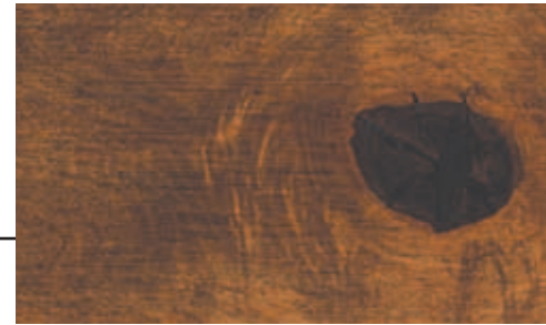
Repaired and/or sound knots