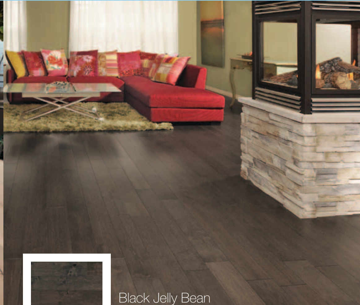
Black Jelly Bean

Get a taste for Black Jelly Bean, a tribute to the pleasures of yesteryear. Pure indulgence and trendy styling for an ambiance you'll definitely want to share.