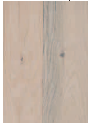
Pronounced color variation