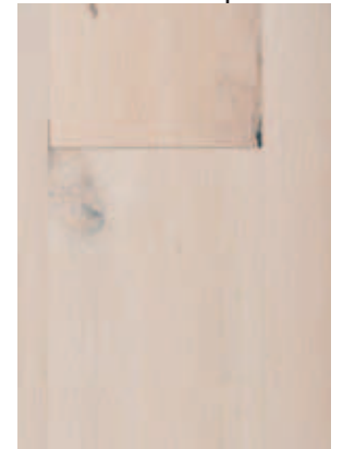
Character or milling marks